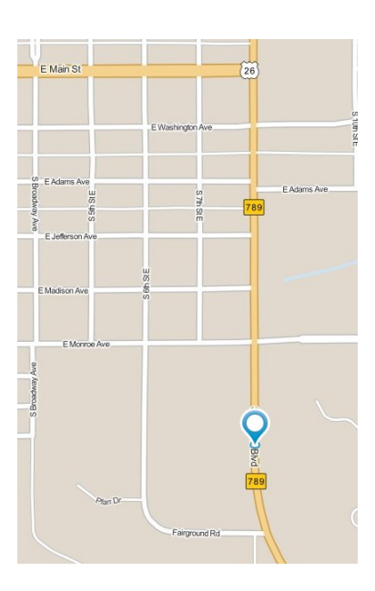
Fremont County Fairgrounds, Riverton WY